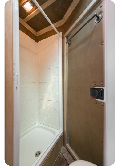
SHOWN WITH OPTIONAL FEATURES.