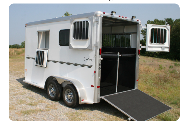
All dimensions are approximate. Photos may show options. Due to constant product improvements, specifications, component parts, standard and optional equipment are subject to change without notice or obligation. Refer to standard and special features for specifics. See your dealer for warranty details. 2021 © Sundowner Trailers, Inc. (07.27.21)

SUNDOWNER TRAILERS, INC. 9805 OK Highway 48 South • Coleman, Oklahoma 73432-8523 800-438-4294 • sundownertrailer.com